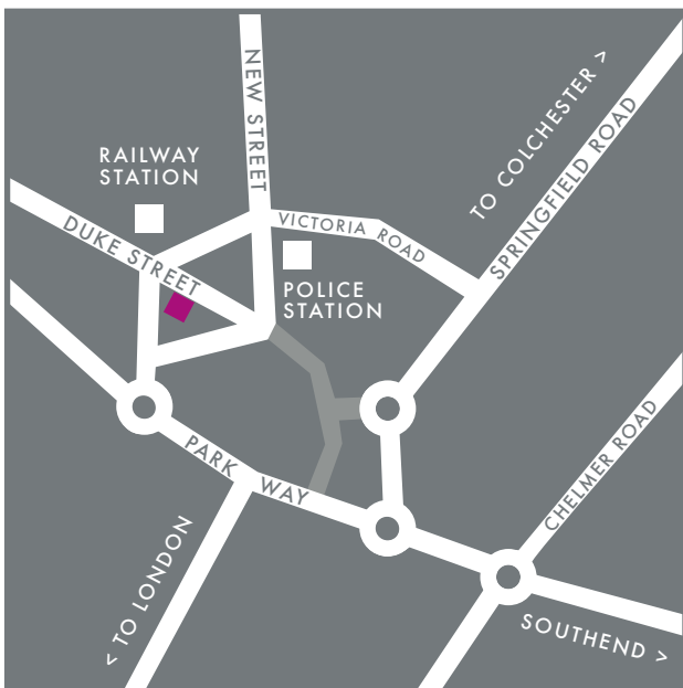
Chelmsford City Centre

If you require any further assistance please telephone: 01245 504 904